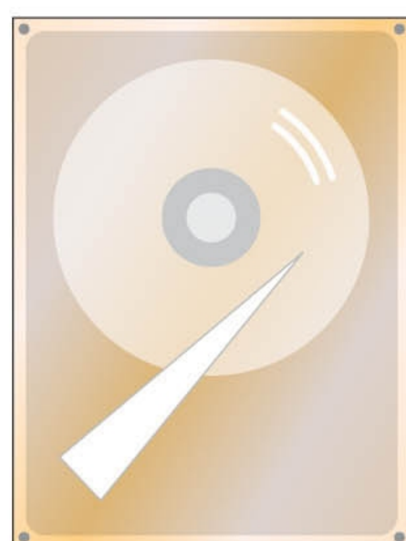
STEP2 Abnormal System

This is the state of malfunctioning due to viruses or malignant codes while the computer is in use.