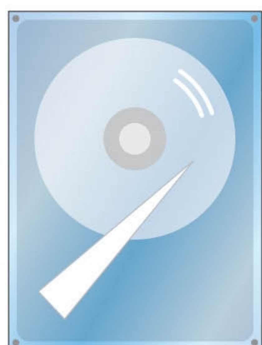
STEP1 Optimal System

This is the stable system configured by the administrator and is protected by the transparent protection screen.