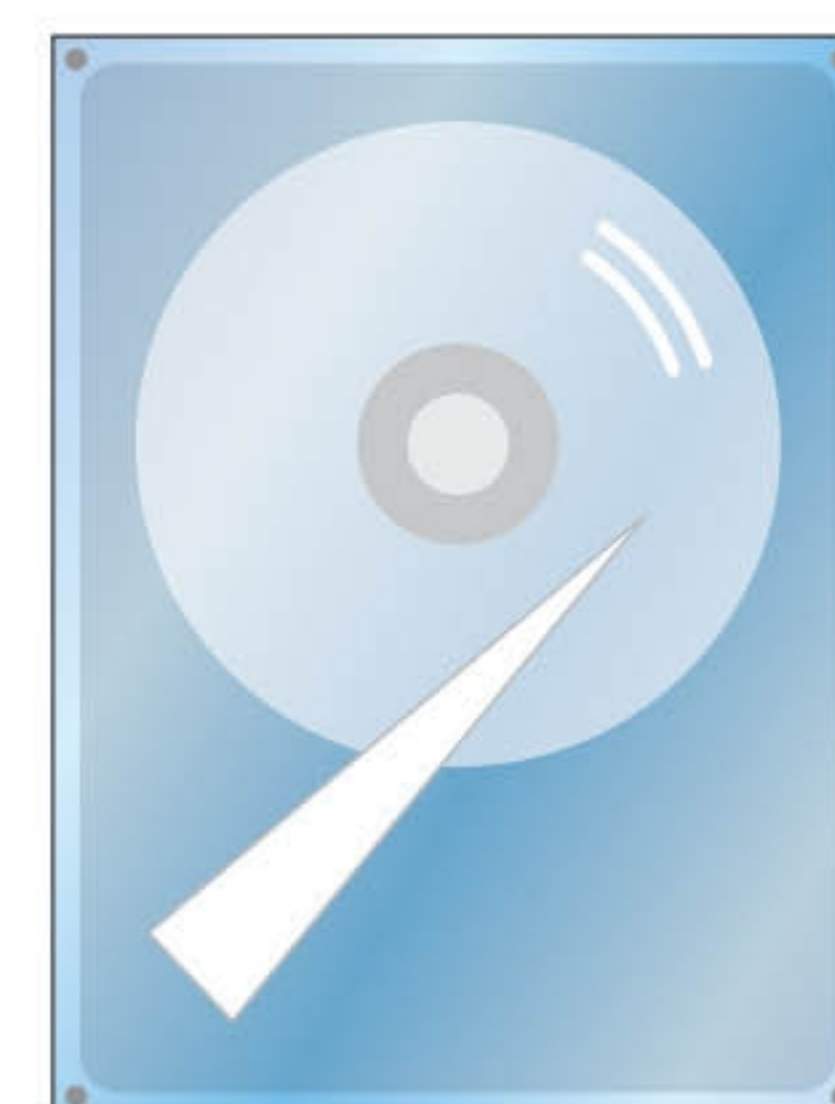
STEP4 Recovery Complete

A new transparent protection screen is covered on the system domain(C:) that needs to be protected. (same state as the STEP1)